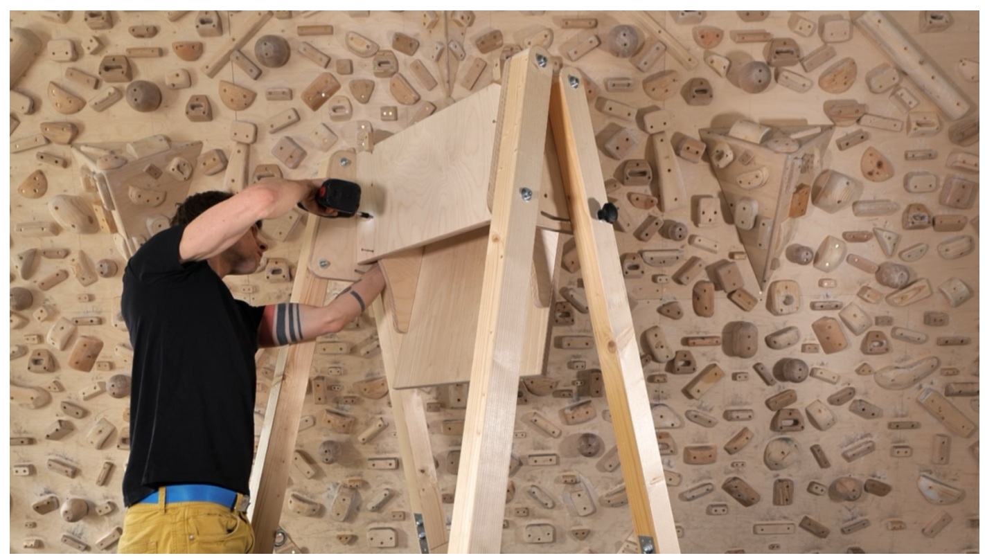
The Campus is finished ! Set it up, attach the rungs and start working out :)

Hook the Campus module to the top of Portal's main board . Align the module, so the attachment holes in the main board are in line with the middle of the Campus sideplates. Attach the module to the main board with 8 screws .